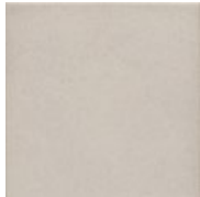
7x7 outdoor 270472