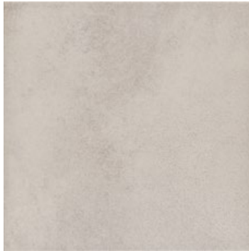
14x14 outdoor 270474