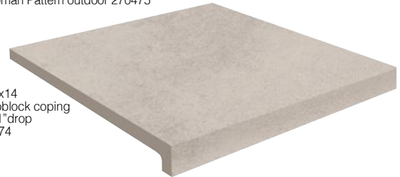
12½ x14 monoblock coping with 1" drop 275474