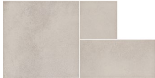
7" Roman Pattern outdoor 270475