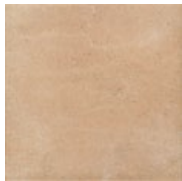
7x7 outdoor 270476