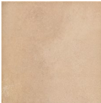
14x14 outdoor 270478