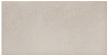
7x14 outdoor 270473