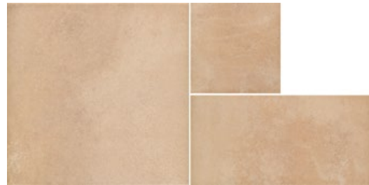
7" Roman Pattern outdoor 270479