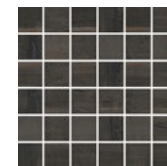
2"x2" square mosaic black - natural 250222