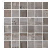
2"x2" square mosaic pearl - natural 250221