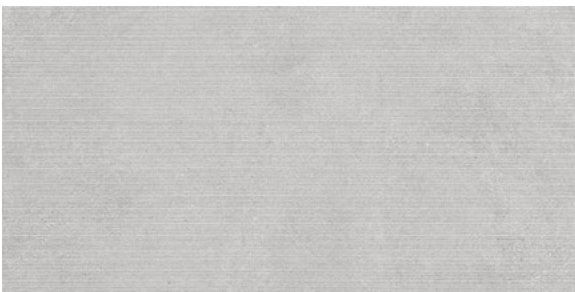
24"x48" field tile: greige rigato 270398