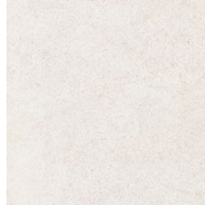
24"x24"x2cm paver: light outdoor 280241