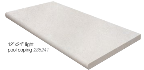
12"x24" light pool coping 285241