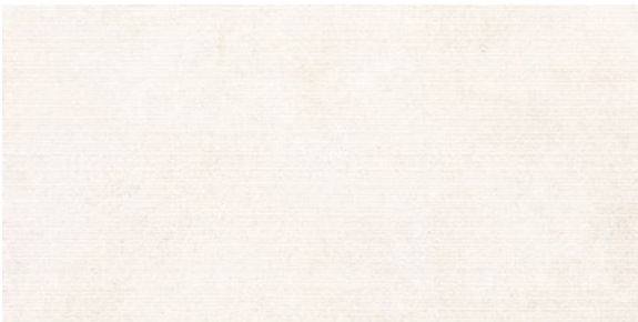
24"x48" field tile: light rigato 270397