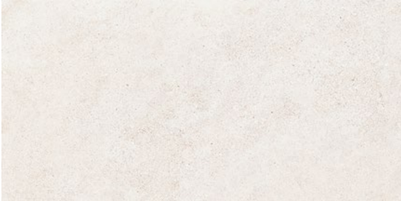
24"x48" field tile: light natural 270395

Silky Stone achieves limestone effect using digital technology. Inspired by the look and feel of nature combined with the practicality of modern architecture, Silky Stone is the result of a sophisticated balance between essentiality and minimalism.